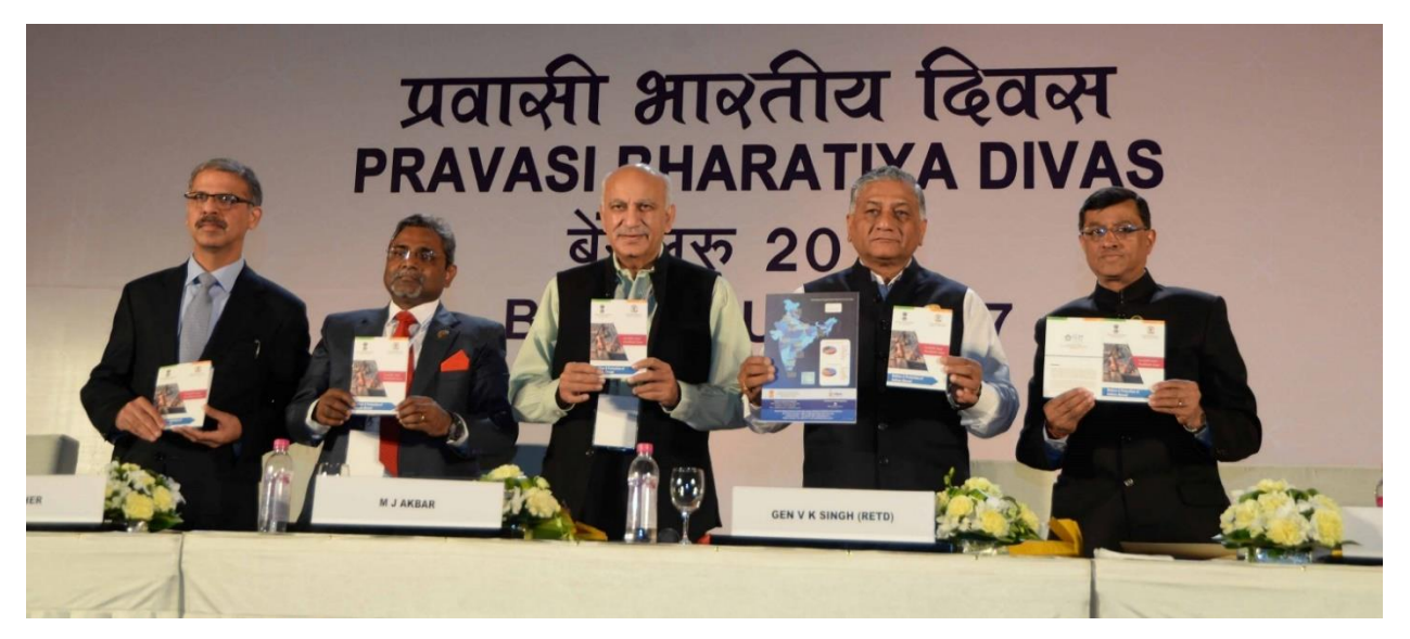
Release of ICM's Booklet on Welfare and Protection of Indians Abroad at Pravasi Bharatiya Diwas, 2017, Bengaluru