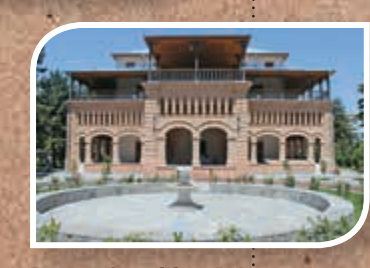
Restoration of Stor Palace

Setting up of 104 water points Clinics, Construction of 46 Water Points (Bore wells). One High School and