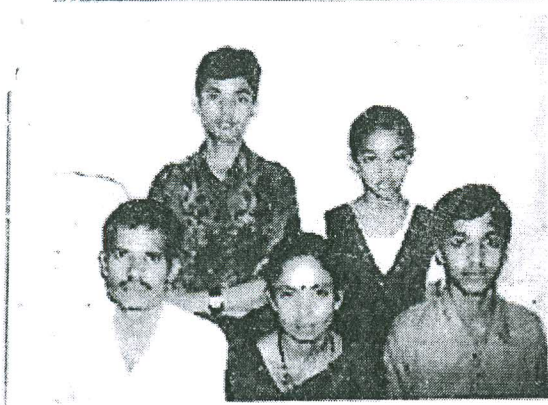
Family Members Details