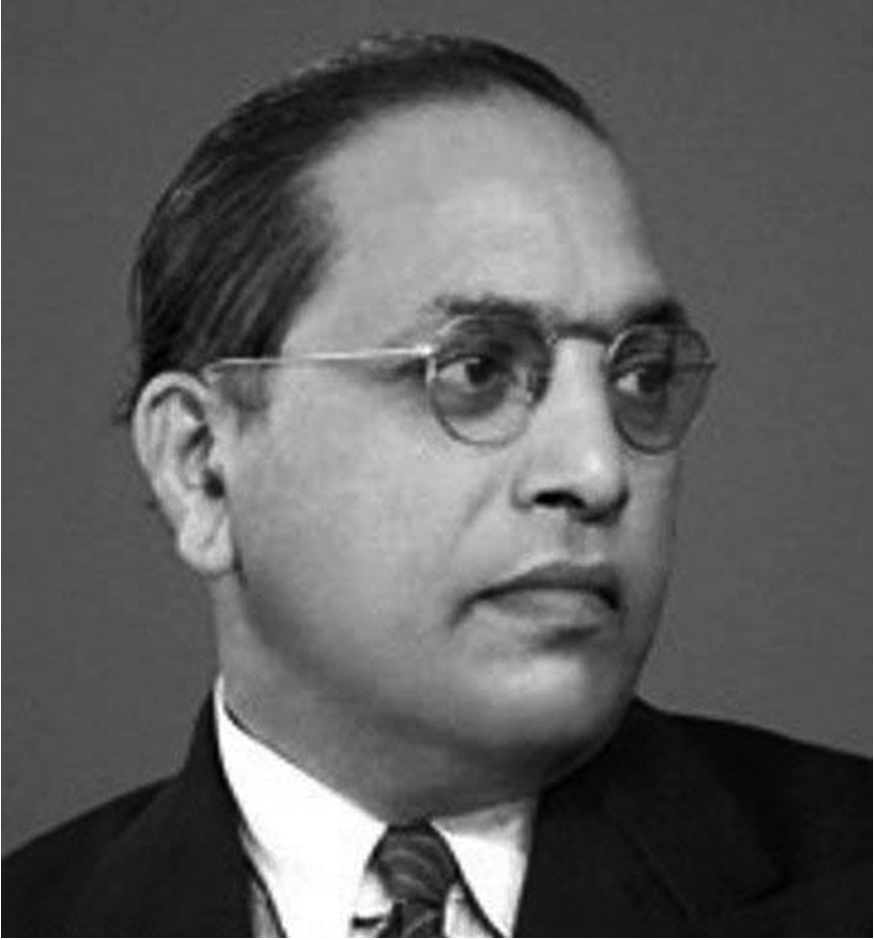
Babasaheb Dr. B.R. Ambedkar (14th April 1891 - 6th December 1956)